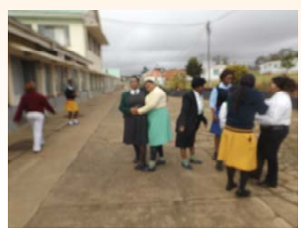
On the left hand side staff members sharing their memories .In between: Staff members embracing our (acting PRO) who made this day successful..