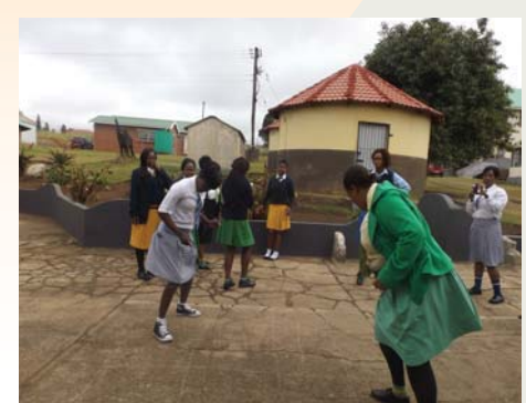
Above: lot of games were played to commemorate this day and to make a memorable event and you c an see, some staff members playing like high school games

As part of wellness programme this helped because other activities involved chasing each other and a lot of jumping was done so our bodies felt warm indeed this was a memorable event