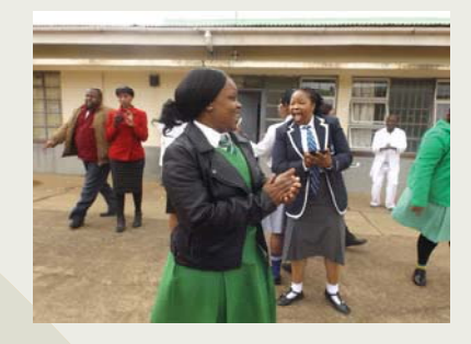
Above: staff members taking some time out enjoying to be like school children again.

As part of wellness programme this helped because other activities involved chasing each other and a lot of jumping was done so our bodies felt warm indeed this was a memorable event