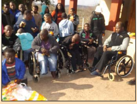
Above: these are the happy faces of Zisize care center they were so pleased to see us spending time with them. They felt like human beings because sometimes they felt abounded by families.